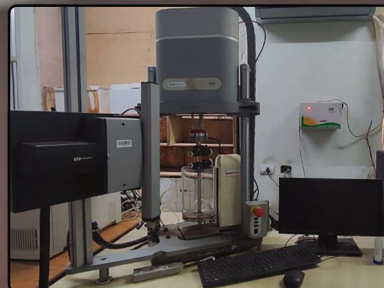
Universal Testing Machine