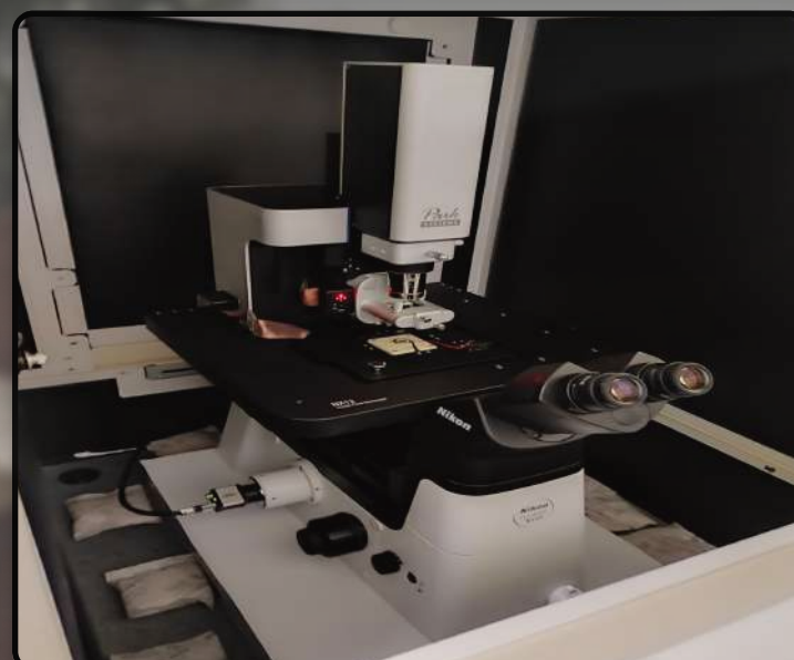
Atomic Force Microscope